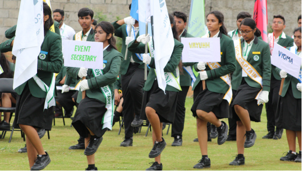
Learning Assessment in Telangana and 8th in India and was ranked 2nd in Day cum Boarding School in Hyderabad.

Meluha School received the prestigious Education Award 'Indian School Rankings 2022-2023' for schools pan-India. Meluha was ranked first in Excellence in